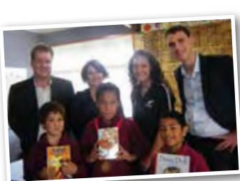
World champion Black fern rugby player Monalisa Codling had a great time at Te Papapa School in Auckland School Sponsor: Goodman Nominee (NZ) Ltd.