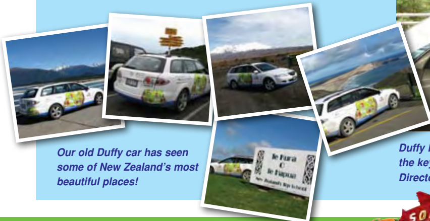
Our old Duffy car has seen some of New Zealand's most beautiful places!

Look out for the new Duffy Car everywhere from Cape Reinga to the Bluff this year and make sure you give it a big wave!