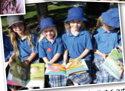
New books always put smiles on the faces of the kids at Timaru South School.