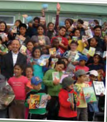
School Sponsor: Rotary Club of Port Nicholson Inc.