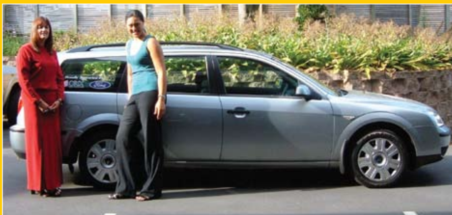
Orix has once again played a vital part in getting the Duffy Theatre on the road in 2008!

not be possible without the support of Orix New Zealand and Esanda Fleet Partners. Thanks for enabling us to get the show on the road!