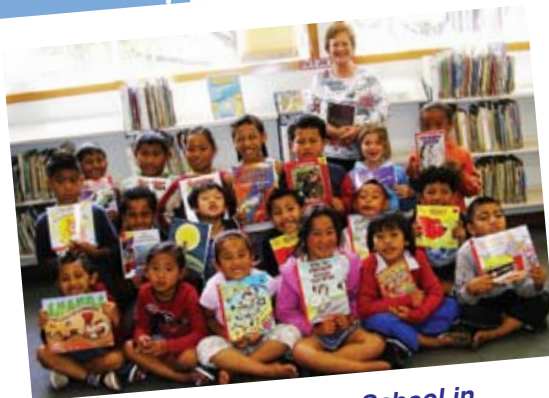
Children from Jean Batten School in Mangere with just some of the 680,869 books distributed during 2007. School Sponsor: Rotary Club of Auckland East