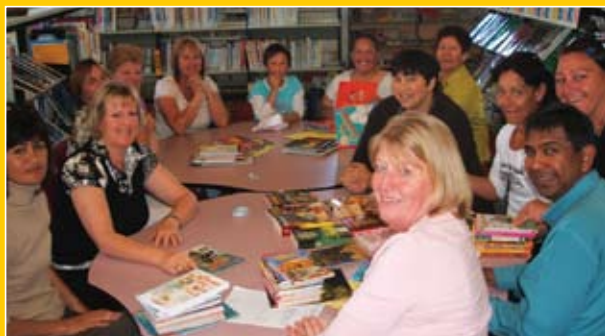
Teachers and Duffy Coordinators from schools around Whangarei take time out from their book selection meeting at Tikipunga Primary School. School Sponsor: Te Puni Kokiri

Thanks also to those coordinators who stayed after the book selection to take part in a Duffy Coordinators meeting. It was a great chance for coordinators to share ideas with each other.